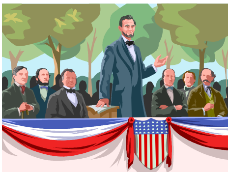
Pictured above: President Abraham Lincoln giving his speech called the Gettysburg Address

one to the faculty, staff, students and families of Audie Murphey Middle School on Fort Hood, Texas. . The club does not usually provide Freedom Shrines to Elementary schools, but this school particularly asked for one. Due to the war on terror and the sacrifices made by our soldiers and airmen, we could not refuse. The Shrines were delivered to the school in April and will be dedicated soon.