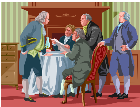
Pictured above: The Signing of the Declaration of Independence)

Members of the Exchange Club of Killeen donated a Freedom Shrine to the faculty, staff, students and families of Montague Village Elementary School on West Fort Hood, Texas and